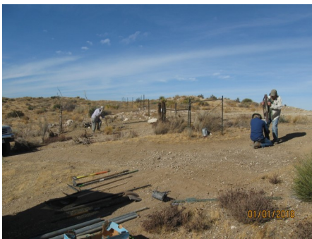
Before - Workgroup Begins Repairs