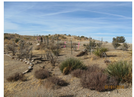
After - Area Upon Completion of Fence Repair and Vegetation Restoration

little south of the BLM kiosk near Japatul Rd. Erosion had badly damaged the road to the point that only a 4X4 vehicle could get through the area. This resulted in people creating a new bypass around the damaged area, further damaging a virgin area of land and plants. They filled in the worst part of the erosion, then created a diversion channel a little farther up the hill on the road to minimize further water erosion in the future. We plan to work more on this damaged road area at another time.